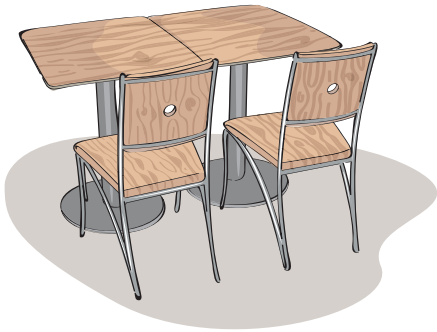
Wooden and laminate furniture