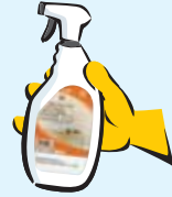
Ready to use