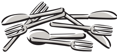
Cutlery and silverware